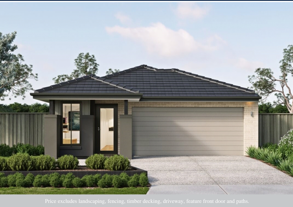
Price excludes landscaping, fencing, timber decking, driveway, feature front door and paths.