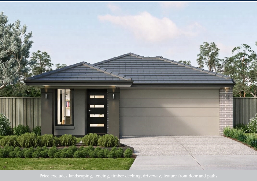
Price excludes landscaping, fencing, timber decking, driveway, feature front door and paths.