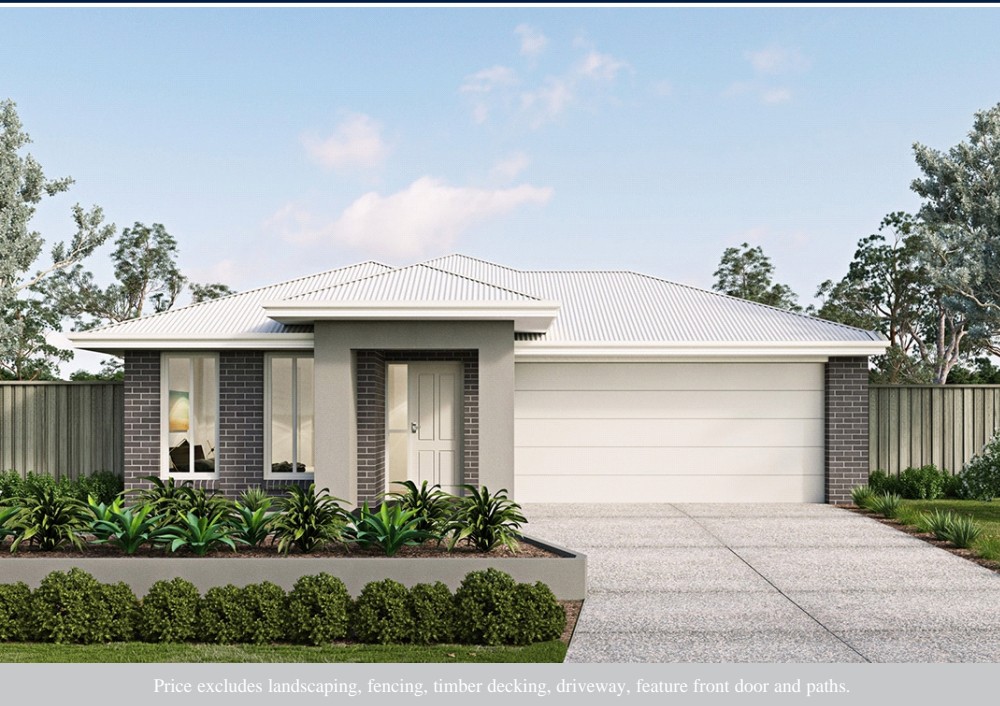
Price excludes landscaping, fencing, timber decking, driveway, feature front door and paths.